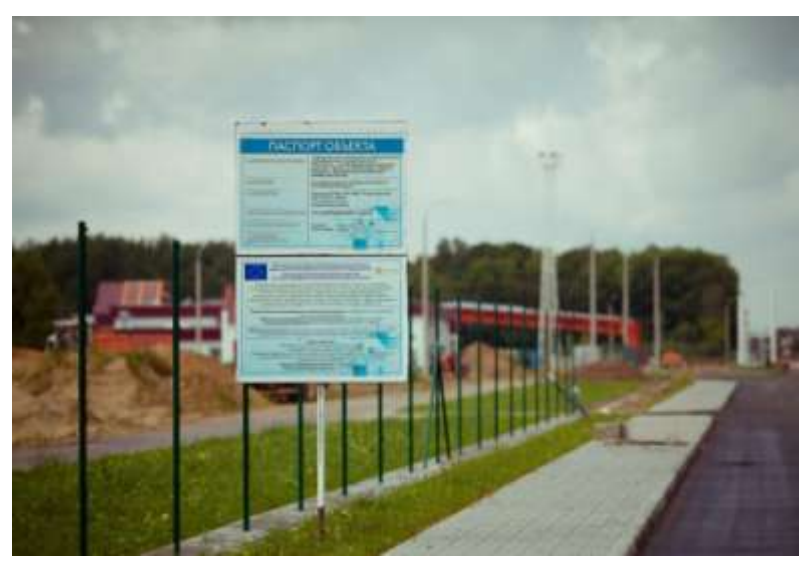
Examples of commemorative plaques